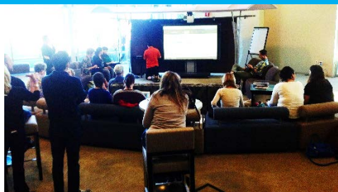
Training Session at the University of Central Florida Morgridge Interantional Reading Center

The Instructional Design Training for ESE Arts Teachers program is training arts educators to design and use interactive modules to differentiate instruction and improve access to quality arts education for ESE students. Participants are developing at least one product for classroom use that teaches and/or assesses the Next Generation Sunshine State Standards in arts courses to ESE students in mainstreamed or self-contained ESE arts classrooms.