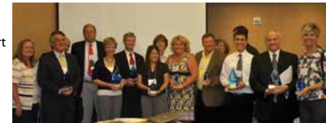
2009 Leadership Awardees and Arts Achieve! Model School awardees